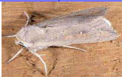
Figure 1. Adult armyworm, Pseudaletia unipuncta (Haworth).

http://edis.ifas.ufl.edu/pdffiles/IN/IN70200.pdf