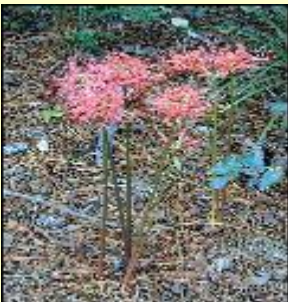
Red Spider Lily